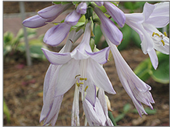
Fried Bananas Hosta flowers

Fried Bananas Hosta will grow to be about 24 inches tall at maturity extending to 3 feet tall with the flowers, with a spread of 4 feet. When grown in masses or used as a bedding plant, individual plants should be spaced approximately 4 feet apart. Its foliage tends to remain dense right to the ground, not requiring facer plants in front. It grows at a fast rate, and under ideal conditions can be expected to live for approximately 10 years.