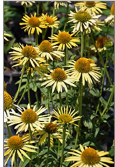
Maui Sunshine Coneflower flowers