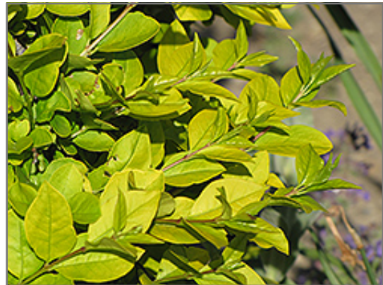
Golden Privet foliage